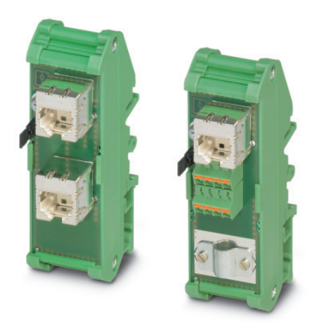
Figure may contain other products.