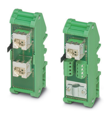
Figure may contain other products.