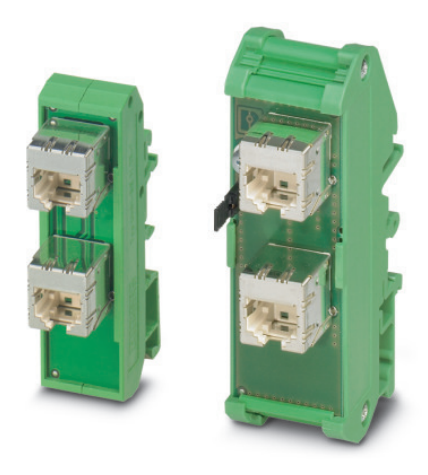
Figure may contain other products.