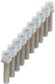
Jumper, Number of positions: 10, Color: silver

Please be informed that the data shown in this PDF Document is generated from our Online Catalog. Please find the complete data in the user's documentation. Our General Terms of Use for Downloads are valid ( http://download.phoenixcontact.com )