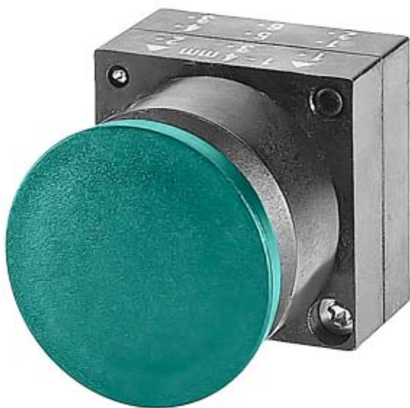
22MM PLASTIC ROUND ACTUATOR: MUSHR.PUSHBUTTON 30MM MOMENTARY CONTACT TYPE WITH HOLDER BLACK