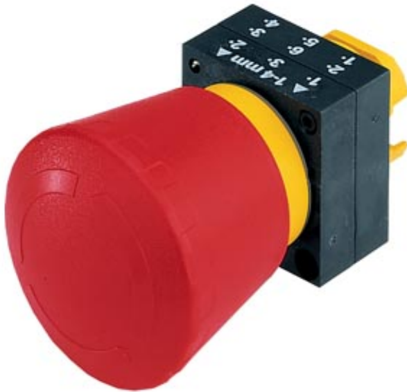
22MM PLASTIC ROUND ACTUATOR: EMERGEN.-STOP MUSHR.PUSHB. 40MM LATCH.W. ROT.-TO-UNLATCH MECH. WITH HOLDER RED