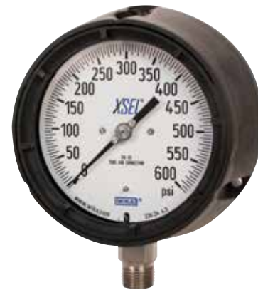
Bourdon Tube Pressure Gauge Model 232.34