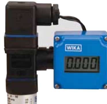
Display installed on Type S-10 or S-11 transmitter

Two user-selectable filtering levels smooth the display during dynamic pressure changes and brief pressure peaks can be suppressed. All programmed parameters are stored in an EEPROM so in the event of a power failure reprogramming is unnecessary.