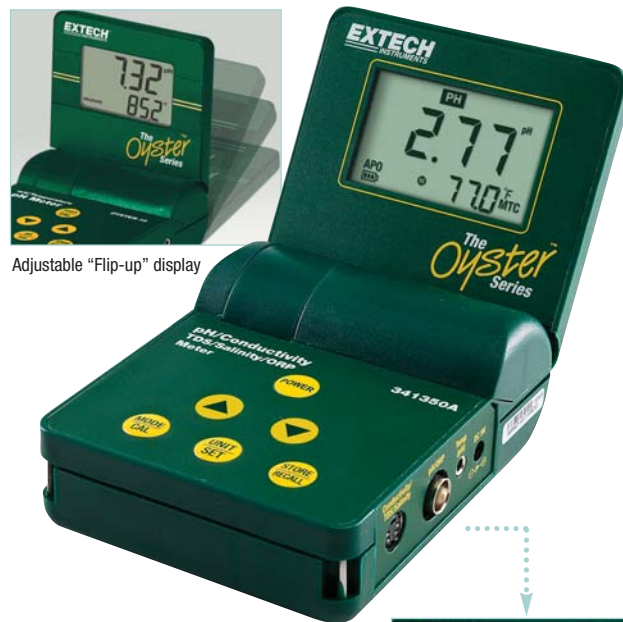
Adjustable “Flip-up” display