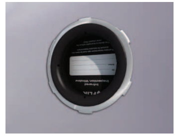
Single PIRma-Lock™ ring nut.