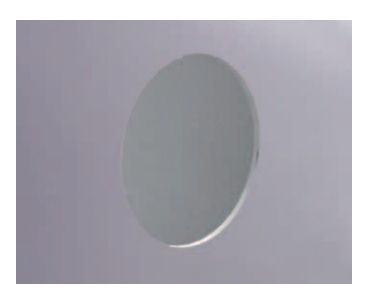
One hole to cut.