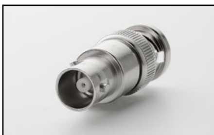
Model 237-BNC-TRX: Male BNC to 3-lug female triax adapter (guard disconnected). Terminates triax cable in BNC plug. High voltage rating for use with 7072-HV.

For use with: 2200-20-5, 2200-30-5, 2200-32-3, 2200-60-2, 2200-72-1