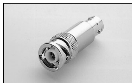
Model 237-TRX-NG: 3-slot triax to 3-lug female triax adapter (guard removed) for non-guarded measurements. High voltage rating for use with 7072-HV, etc.

For use with: 4200-SCS, 6517A, 6517B, 7078-TRX cables