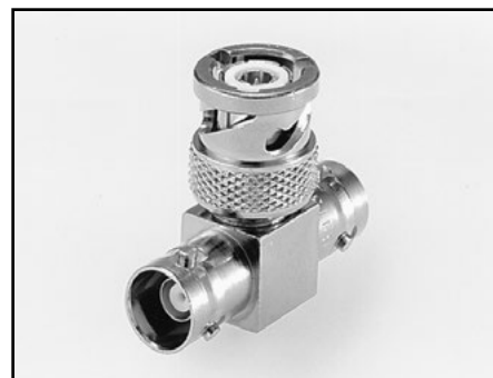
Model 237-TRX-T: 3-slot male to dual 3-lug female triax tee adapter for use with 7078-TRX cables and 7072/7072-HV Semiconductor Matrix Cards. High voltage rating for use with Model 6517B Electrometer.

For use with: 2635B, 2636B, 4200-SCS, triax interconnect