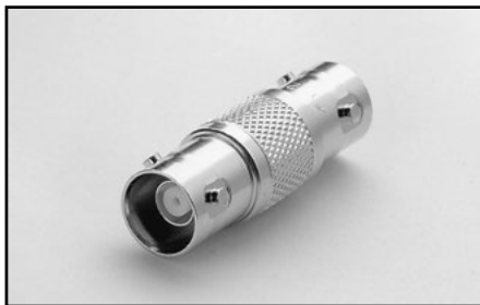
Model 237-TRX-BAR: 3-lug triax barrel (female to female) for use with triax interconnect.

For use with: 4200-SCS, 7072, 7072-HV, DMMs