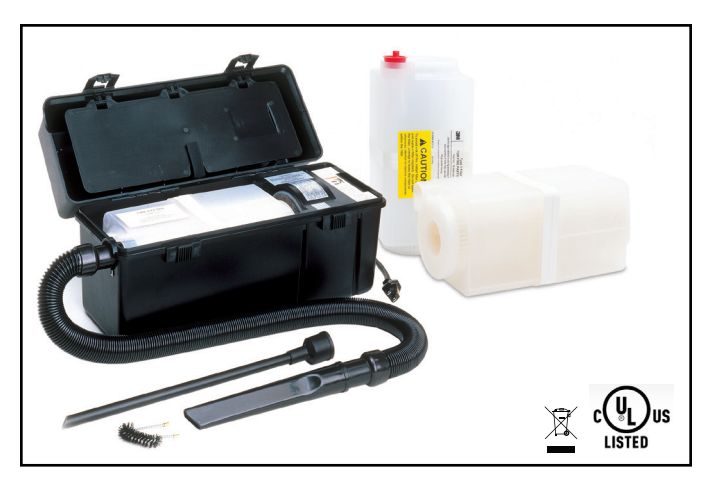
Figure 1. 497AJK HEPA Vacuum.