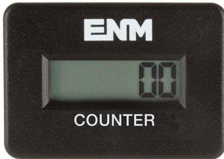
C44F65C 4.5-60 VDC/VAC 50/60 Hz C44F69C 115-275 VDC/VAC 50/60 Hz

ENM's series C44 Counter features a 6-digit, 7 segment LCD display. The accumulated counts are stored on powerless, non-volatile data backup using CMOS EEPROM technology, where small space and reliable instruments are required with memory that does not rely on a battery.