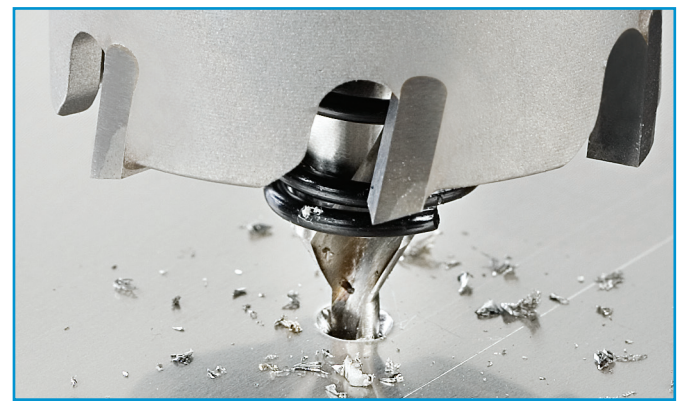
Exclusive SmoothStart ^{\text{TM}} pilot drill guides cutter to prevent damage to cutter head.