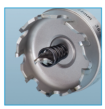
Quickly drills precise holes without penetration beyond sheet metal.

Integral arbor provides smooth accurate holes 36-305 10 Pipe 84 Integrated overdrill flange prevents penetration beyond the sheet metal Carbide-tips cut over 200 holes through stainless steel, and outperform HSS cutters and bi-metal hole saws in sheet steel effortlessly ejects slug Exclusive SmoothStart™ pilot drill guides cutter to prevent cutter damage and provide