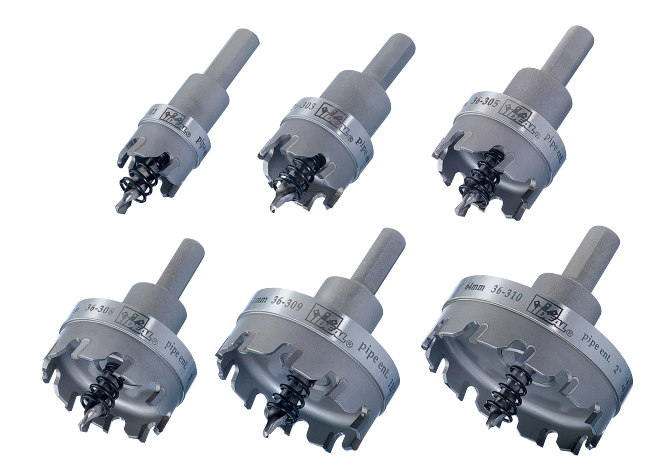
To extend the life of your TKO's use cutting oil.

Available in a full range of sizes from 3/4" to 4½".