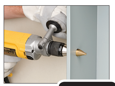
Drill Pilot Hole