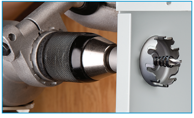
Integrated over-drill flange prevents penetration beyond the sheet metal.