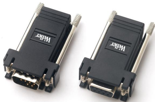
WX Adapter for PC Order No. 0058764711

Order No. 0052920999 (0052920899 for pencil only)