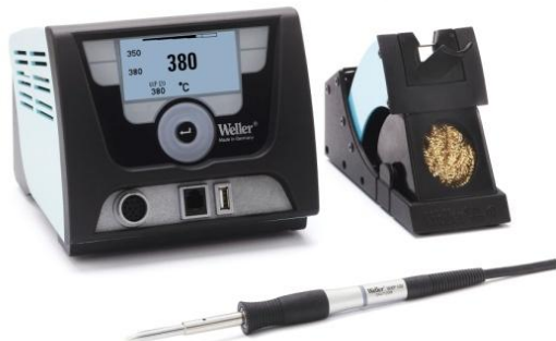
WX 1 control unit with WXP 120 (120 W / 24 V) soldering pencil and WDH 10 safety rest