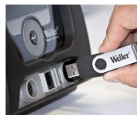
Multi-purpose USB port