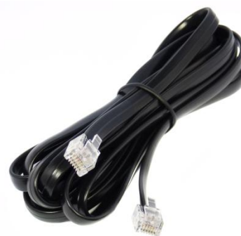
WX connection cable Order No. 0058764710