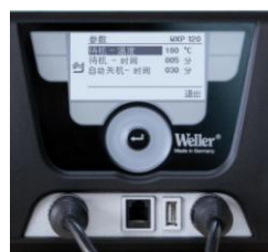
Multiple language menu navigation