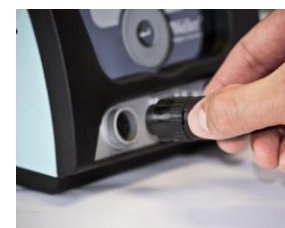
WX tool connection