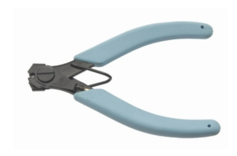
Xcelite 5.45" Hard Wire (Piano and Music) Cutter with Blue Cushion Grip Handles