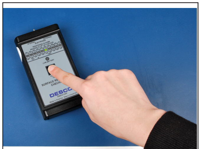
Figure 3. Using the internal parallel electrodes to measure surface resistance

Note: For worksurfaces, use Desco Item# 10435 Reztore™ Antistatic Surface and Mat Cleaner or other silicone-free ESD cleaner. Be sure the surface is dry before testing.