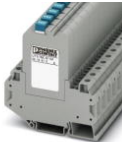
Thermomagnetic circuit breaker, 1-pos., for DIN rail mounting

Please be informed that the data shown in this PDF Document is generated from our Online Catalog. Please find the complete data in the user's documentation. Our General Terms of Use for Downloads are valid ( http://download.phoenixcontact.com )