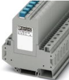
Thermomagnetic circuit breaker, 1-pos., for DIN rail mounting

Please be informed that the data shown in this PDF Document is generated from our Online Catalog. Please find the complete data in the user's documentation. Our General Terms of Use for Downloads are valid ( http://download.phoenixcontact.com )