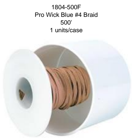
1804-500F Pro Wick Blue #4 Braid 500' 1 units/case