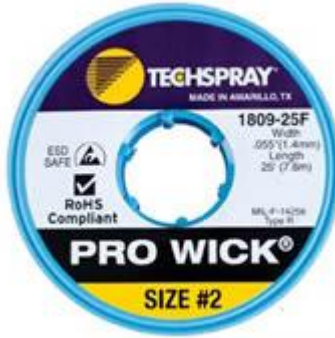
1810-25F Pro Wick Green #3 Braid - AS 25' 1 units/case