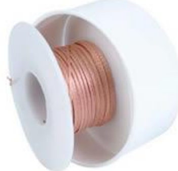
1809-25F Pro Wick Yellow #2 Braid - AS 25' 1 units/case