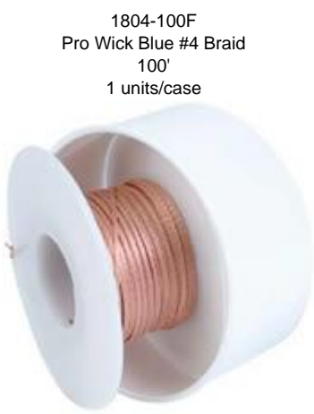
1804-100F Pro Wick Blue #4 Braid 100' 1 units/case