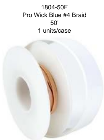
1804-50F Pro Wick Blue #4 Braid 50' 1 units/case