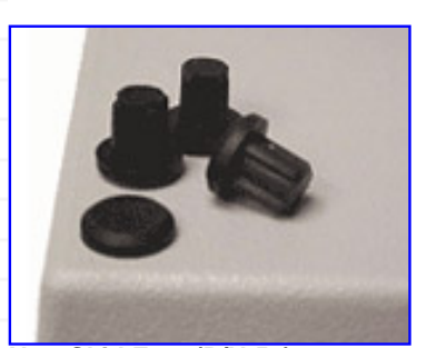
Non-Skid Feet (P/N 50) RETURN TO TOP