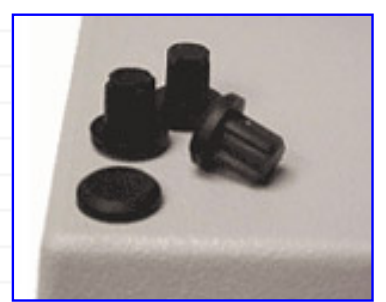
Non-Skid Feet (P/N 51) RETURN TO TOP

Home | About SERPAC | Products | Accessories | Customizations | Distributors | Buy Now! | Contact Us PRODUCTS: A-Series | C-Series | CH-Series | G-Series | H-Series | M-Series | R-Series | S-Series | SL-Series