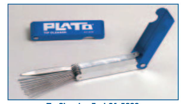
Tip Cleaning Tool 01-5000

May be used on all popular desoldering equipment such as Pace ^{\circ} , Weller ^{\circ} , Plato ^{\circ} , Air-Vac ^{\circ} , APE ^{\circ} , Hakko ^{\circ} , and many others. Contains various tip cleaning rods from .020" (.5mm) to .065" (1.65mm) diameter.