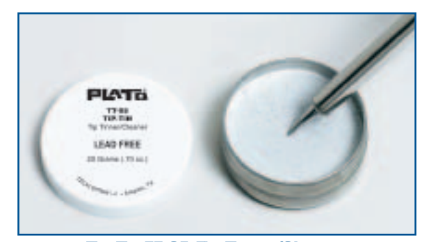
Tip-Tin TT-95 Tip Tinner/Cleaner