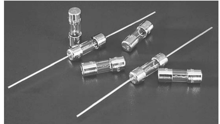
225 000 Series

Contact Littelfuse concerning other ampere ratings.