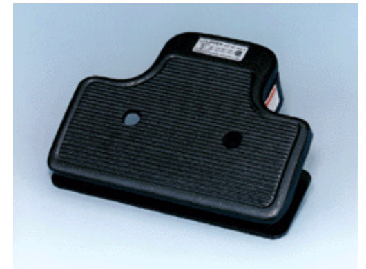
Clipper Wide Treadle Footswitch

Model 638-S features a cast aluminum housing painted Alert Orange with a splash resistant interior switch.