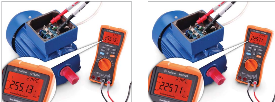
Figure 2: Comparison of voltage output from industrial motor VFD without and with Low Pass Filter functionality.

The U1270 series offers a 1 kHz LPF or Low Pass Filter to provide accurate Variable Frequency Drive (VFD) output measurement. This function eliminates high frequency noise and harmonics. This ensures the efficiency of your motor filter as well.