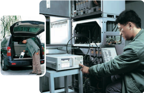
Performing general purpose installation and maintenance, or service and repair, but don't want more test functionality than necessary – Agilent's N9310A RF signal generator is your answer.