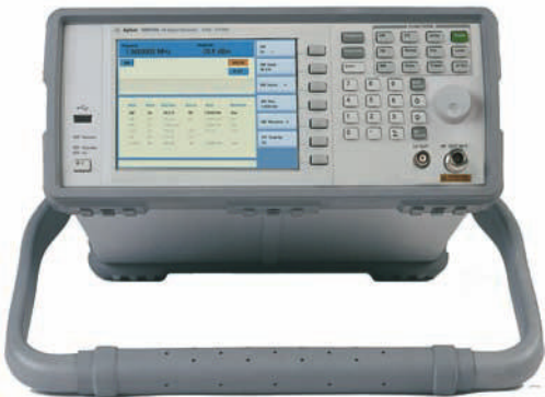
The N9310A can become portable with handle and bumper. It makes it an ideal choice for installation and maintenance.

Being small and lightweight, an N9310A signal generator is as convenient for field troubleshooting use as it is for bench-top use, where space is often at a premium.