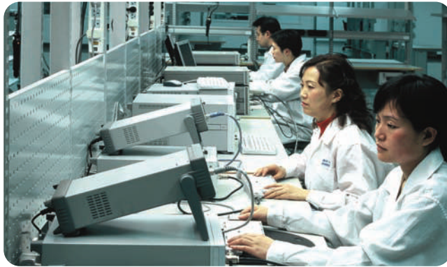
Agilent`s new low-cost, compact signal generator provides a money-saving solution in high-volume manufacturing applications.

Now you know the signal generator to choose when you are ramping up your volume manufacturing. Moreover, you can be confident that the price and performance will please your management team, too.