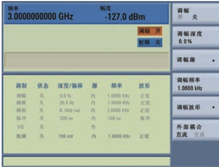
Multi-language display and instruction help ensure easy operation of your signal generator, no matter who`s using it.

Optional rack mount kit enables simple stacking with other test equipment in standard test racks. The rackmounted signal generator is full width and a compact, standard 3U height.