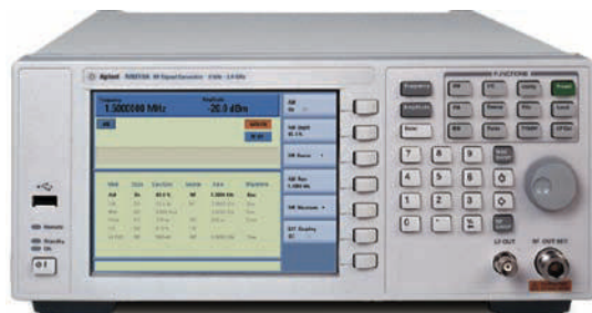
N9310A RF Signal Generator

All the capability and reliability of an Agilent instrument you need — at a price you've always wanted