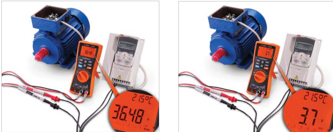
Figure 2. U1272A helps you identify the presence of stray voltage on a disconnected wire running parallel with the wire powering up the VFD to an industrial motor. The image on the right shows the U1272A in low impedance mode.

The peak detect function allows you to capture the engine or motor startup transient as fast as 250 \mu s.