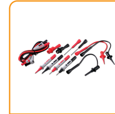
U1168A Standard test lead kit