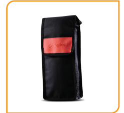
U1175A Carrying case

AREA FOR DISTRIBUTOR LOGO AND CONTACT INFORMATION, Dotted line does NOT print; defines usable area ONLY