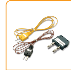
U1180A Thermocouple adapter/lead kit