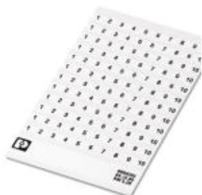
Marker card, self-adhesive, horizontally labeled with the consecutive numbers: 1 ... 10, 10-section marker strips with 12 identical decades, white

Please be informed that the data shown in this PDF Document is generated from our Online Catalog. Please find the complete data in the user's documentation. Our General Terms of Use for Downloads are valid ( http://download.phoenixcontact.com )