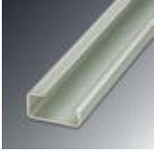
G rail 32 mm (NS 32)

DIN rail, unperforated - NS 32 AL UNPERF 2000MM - 1201028