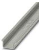
DIN rail, material: Steel, unperforated, 2.3 mm thick, height 15 mm, width 35 mm, length: 2 m

DIN rail, unperforated - NS 35/15-2,3 UNPERF 2000MM - 1201798