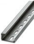
G-profile DIN rail, material: Steel, perforated, height 15 mm, width 32 mm, length 2 m

DIN rail perforated - NS 32 PERF 2000MM - 1201002