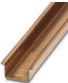
DIN rail, material: Copper, unperforated, 1.5 mm thick, height 15 mm, width 35 mm, length: 2 m

DIN rail, unperforated - NS 35/15 CU UNPERF 2000MM - 1201895