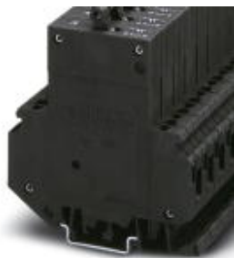
Thermomagnetic circuit breaker, 1-pos., normal blow, 1 N/O contact, with universal foot for mounting on NS 32 or NS 35

Please be informed that the data shown in this PDF Document is generated from our Online Catalog. Please find the complete data in the user's documentation. Our General Terms of Use for Downloads are valid ( http://download.phoenixcontact.com )