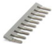
Insertion bridge, Number of positions: 80, Color: gray