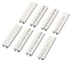
Zack marker strip, 10-section, vertically labeled with the consecutive numbers: 41 ... 50, white, width: 5 mm

Please be informed that the data shown in this PDF Document is generated from our Online Catalog. Please find the complete data in the user's documentation. Our General Terms of Use for Downloads are valid ( http://phoenixcontact.com/download )