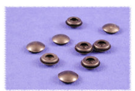
click to enlarge