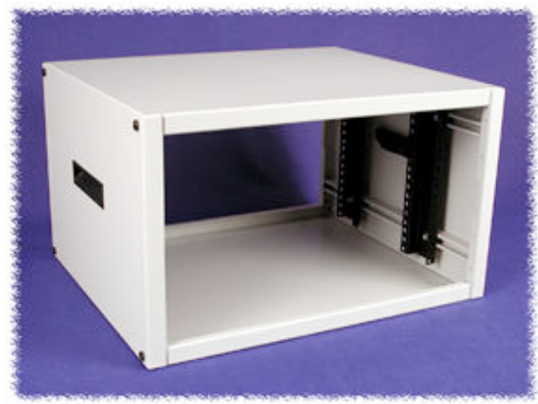
Textured - Light Gray (RAL7035)