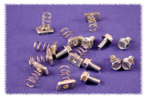
click to enlarge