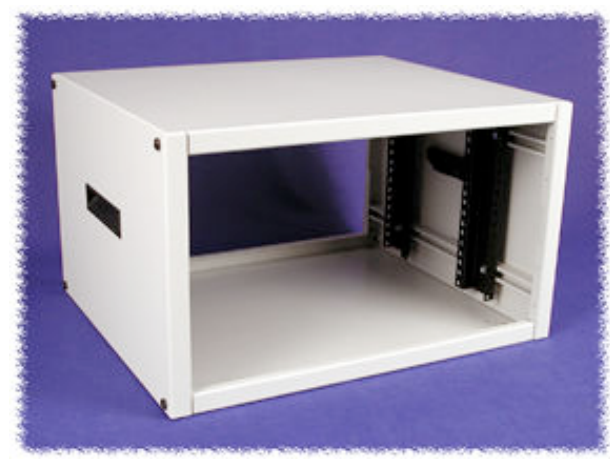
Textured - Light Gray (RAL7035)