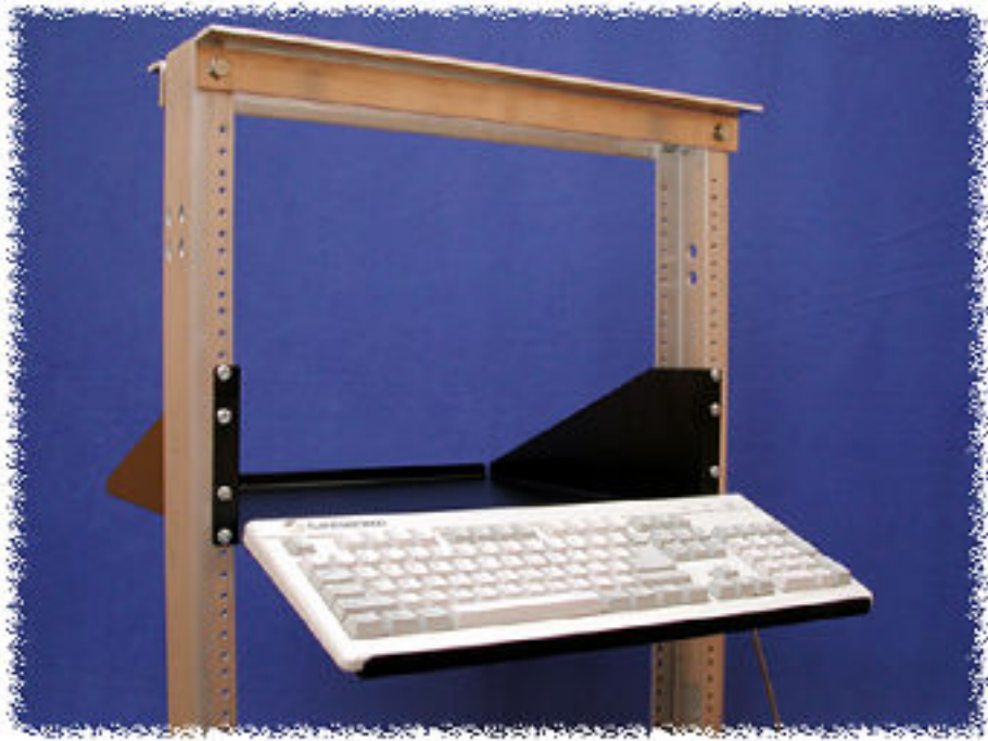
(keyboard not included)

Shelf Shown Mounted To An Open Aluminum Relay Rack