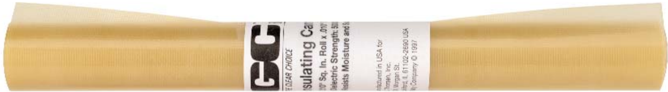
Fig. 2 Note: 210 sq. in. (9 in. wide) • Dielectric Strength 5,000 V