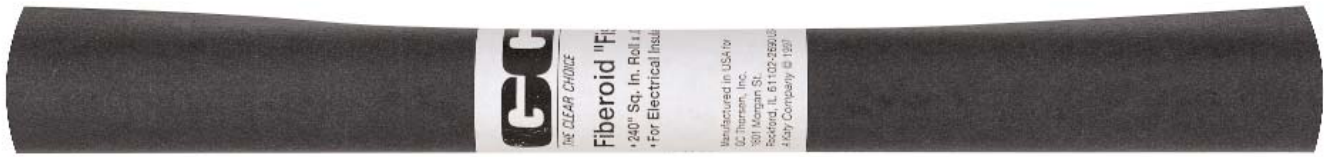
Fig. 1 Note: 0.01" ±10% Thickness