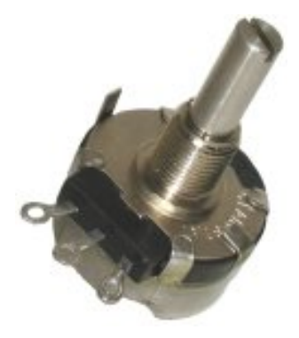
Representative photograph, actual product appearance may vary.

Due to regional agency approval requirements, some products may not be available in your area. Please contact your regional Honeywell office regarding your product of choice.