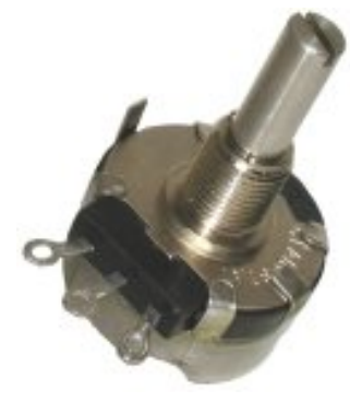
Representative photograph, actual product appearance may vary.

Due to regional agency approval requirements, some products may not be available in your area. Please contact your regional Honeywell office regarding your product of choice.