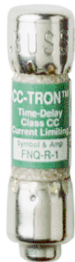
FNQ-R-1/2 Class CC, Time Delay Fuse

Homepage About Cooper Bussmann Contact Us Privacy Legal Cooper Bussmann® Brand Site Map