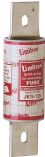
JKS-5 Class J, Fast Acting Fuse, 5A