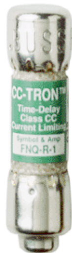
FNQ-R-1-1/2 Class CC, Time Delay Fuse

Homepage About Cooper Bussmann Contact Us Privacy Legal Cooper Bussmann® Brand Site Map