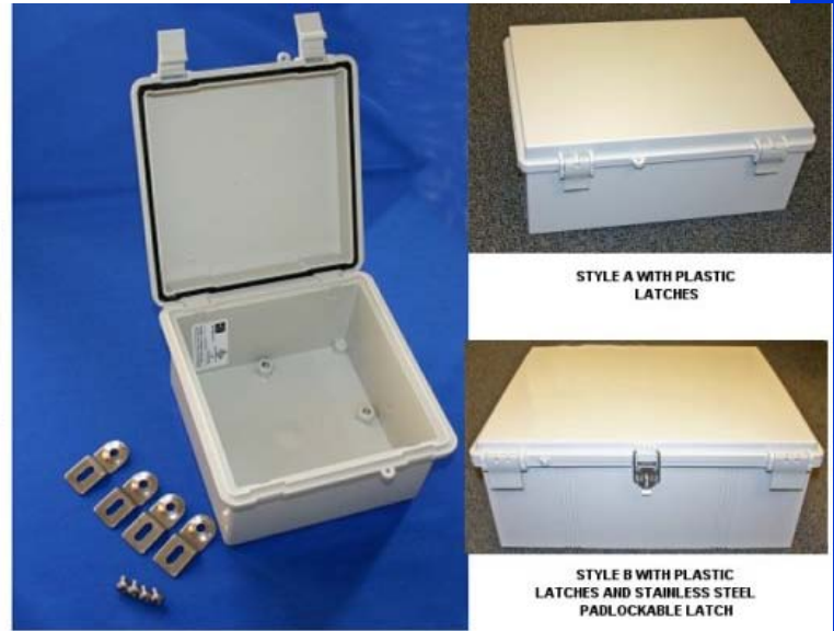
Click on Image for Larger View

These gasketed all-plastic enclosures have been designed to meet NEMA 1, 2, 4 and 4x and IEC529-IP66 requirements, which allows them to be used in many wet, dirty and/or corrosive environments.