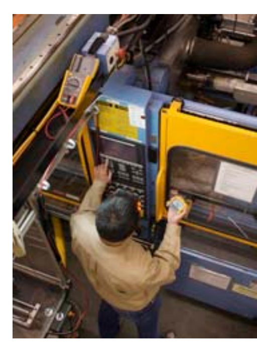
Fluke. Keeping your world up and running.®