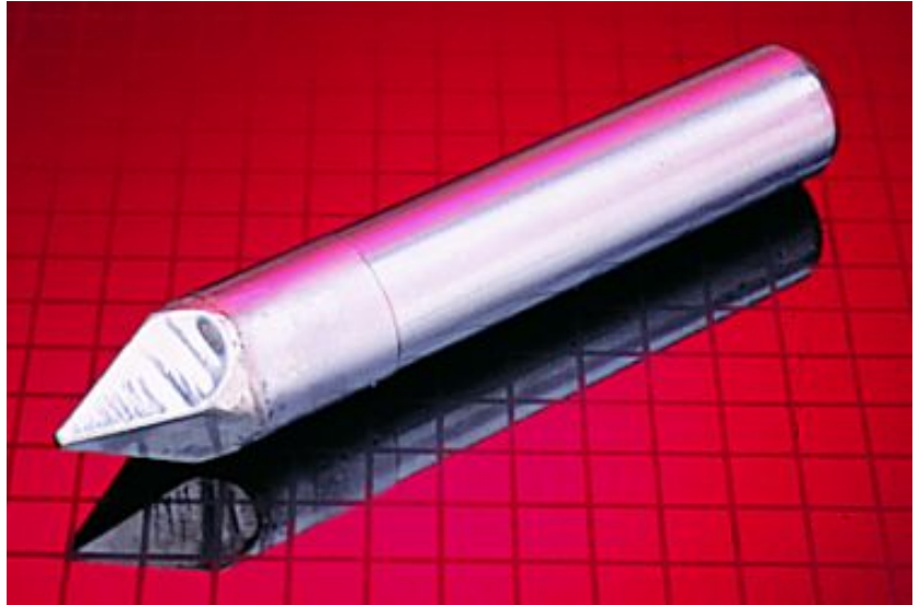
Paragon Soldering Iron Tips Model 45D