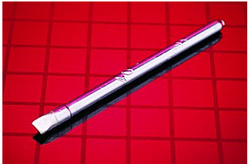
Paragon Soldering Iron Tips Model 501