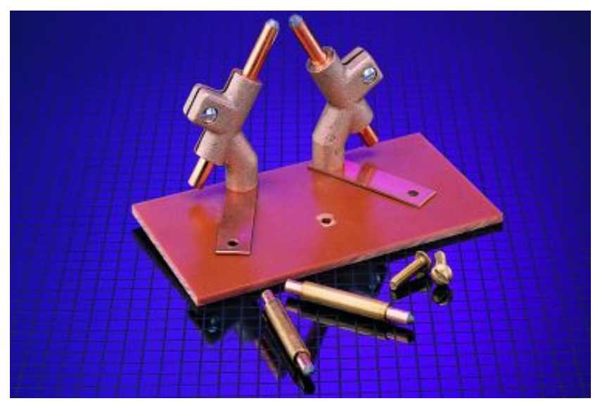
Panel Attachement for 1,100 Watt Power Unit Model 10513A

Attaches to Model 105B2 Power Unit to hold two electrodes. Comes with two 1/4" (6.35mm) and two 3/8" (9.53mm) diameter carbon electrodes and two Adapter Bushings, Model 10538. Used to desolder and assemble automotive alternators, starters for autoelectric rebuild, bus bar and similar electrical work.