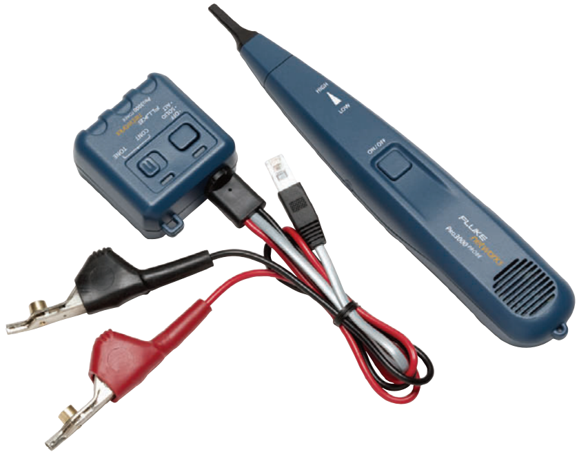
Pro3000 Toner and Probe

The Pro3000 Analog Tone and Probe are your best choice for toning and tracing wire on non-active networks, and specifically for identifying individual pairs with SmartTone™ technology. Angled bed-of-nails clips allow easy access to individual wires, and the RJ11 connector is ideal for use on telephone jacks. The large loud speaker on the probe allows you to hear through drywall, wood or other enclosures to find wires quickly and easily. You can send this loud tone up to 10 miles on most cables! Attach the nylon pouch to your belt, and you will be equipped for any wire identification job.