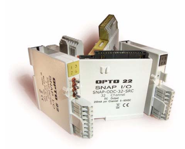
SNAP Digital Input Modules