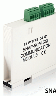
SNAP SSI Module

To install, configure, and use the SNAP-SCM-SSI, see form #1931, the SNAP SSI (Serial Synchronous Interface) Module User's Guide , available on our website.