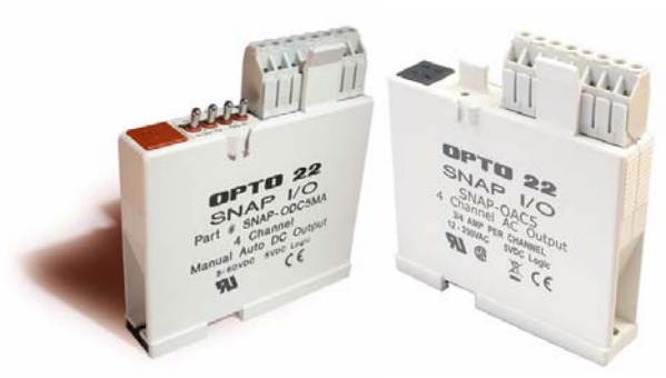
SNAP Digital Output Modules