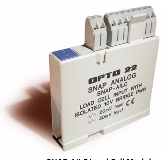
SNAP-AILC Load Cell Module

The SNAP-AILC and SNAP-AILC-2 are configured using PAC Manager or PAC Control.