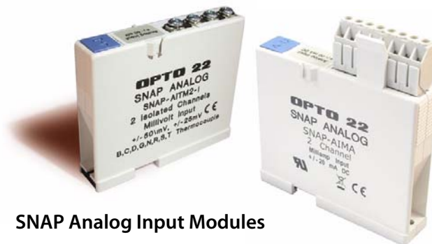
SNAP Analog Input Modules

IMPORTANT: Any system using analog sensors and input modules should be calibrated annually for analog signals. For I/O units on a SNAP PAC System, use the PAC Control™ commands “Calculate and Set Offset” and “Calculate and Set Gain.” For other Ethernet-based I/O units, you can also use PAC Manager™ software to calculate and set offset and gain.