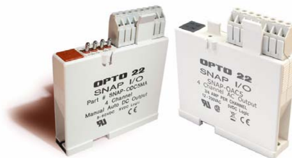
SNAP Digital Output Modules